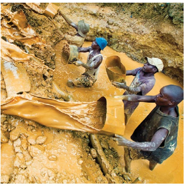
Water yellowed by cassiterite collected for sluicing, DRC

At the same time, national and regional policy dialogue on harmonised regional standards offers an opportunity to strengthen public awareness and stakeholder consensus on what should be done to health in the extractive sector, and to strengthen knowledge and implementation of the law.